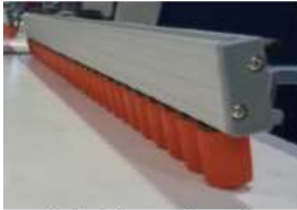
Angled idle guide roller option for 0.12" base

The Compacta SPG features vertically adjustable infeed and outfeed with motorized belt conveyors and adjustable idle roller side guides. Side guides are angled to reduce vibration during the wrapping process. This machine is ideal for lighter products being wrapped with thin substrates.