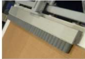
Horizontal idle guide roller option for 0.12" base